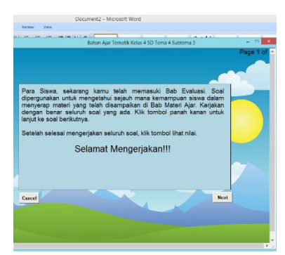
Figure 3. Evaluation Example

Figure 2 contains the menu, which consists of instructions for use, competencies, teaching materials, evaluations, games, reference lists and authors.