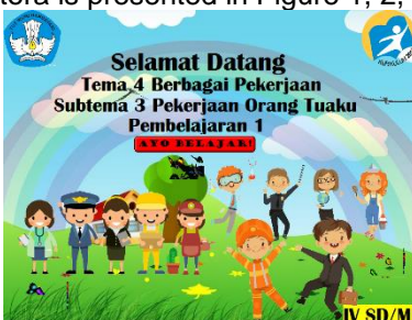
Figure 1. Covers

Media design using Lectora is presented in Figure 1, 2, 3, and 4.