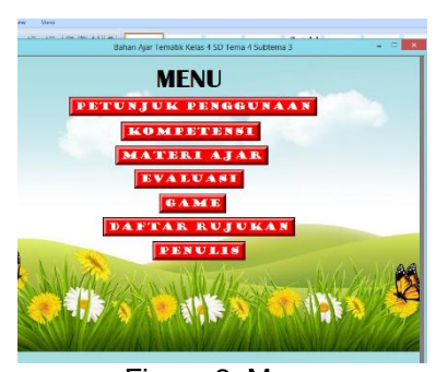
Figure 2. Menu

Figure 2 contains the menu, which consists of instructions for use, competencies, teaching materials, evaluations, games, reference lists and authors.