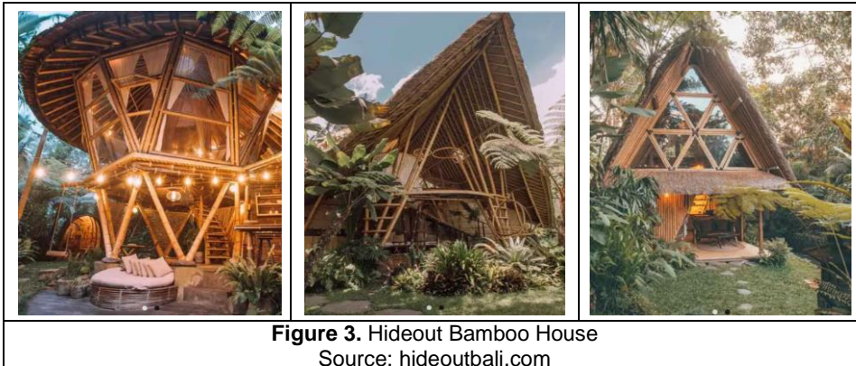
Figure 3. Hideout Bamboo House

The building structure uses locally sourced bamboo from the mountains of Karangasem, grown at an altitude of 800 meters above sea level, giving it high density, low sugar content, and natural resistance to termites. The bamboo treatment process involves smoking techniques and non-toxic materials, reinforcing a commitment to sustainable building principles and environmental safety. Hideout Bali stands out for its organic and minimalist architectural approach, creating an immersive living experience in harmony with nature without excessive use of artificial infrastructure or energy. Its existence reflects a tangible form of adaptive bamboo architecture that combines the artistry of local craftsmanship, material sustainability, and a contemporary green lifestyle.