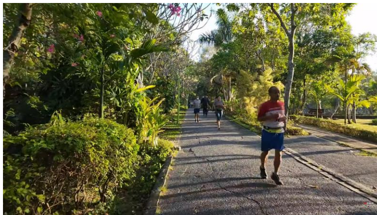
Figure 3. Lumintang City Park

Lumintang City Park represents the emerging modern face of Denpasar's public spaces—more interactive, digital, and youth-oriented. Field observations show the park is particularly active during the evening, enhanced by sensor-based smart lighting systems. Public Wi-Fi access, digital sound systems, and LED public information displays demonstrate the integration of smart infrastructure in the city's outdoor environments.