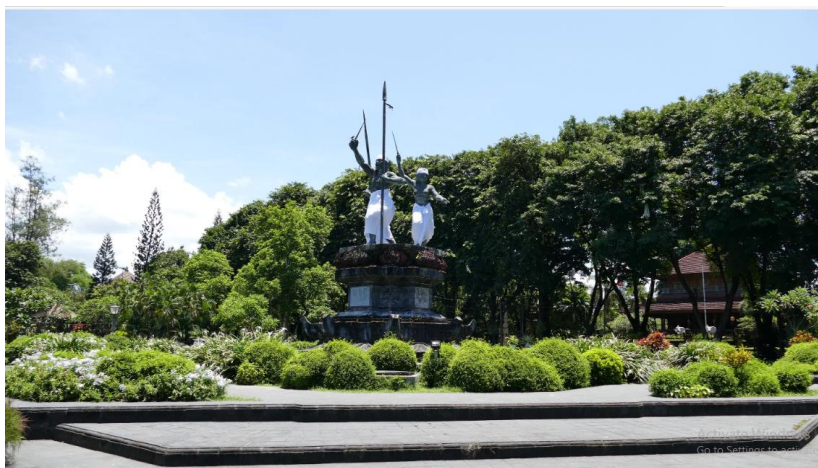
Figure 2. Puputan Badung Field

Puputan Badung Field is the civic heart of Denpasar, rich in historical significance and spirituality. It serves as a venue for traditional ceremonies, historical commemoration, and daily social interaction among residents. Observations indicate that although its traditional functions remain, there has been a shift in how the space is utilized—from ritual practices toward recreational activities. Additionally, technological infrastructure such as smart lighting, CCTV surveillance, and public Wi-Fi has been implemented since 2019 through the Denpasar Smart City initiative. While these upgrades enhance social function and safety, they also pose challenges in balancing modernization with the preservation of traditional values (Choi et al., 2023).