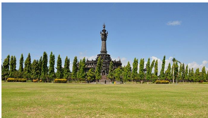
Figure 4. Niti Mandala Renon Field

Niti Mandala Renon Field exemplifies a relatively balanced integration of cultural, recreational, and tourism functions. The area is surrounded by government buildings, a museum, and the Bajra Sandhi Monument—the landmark commemorating Bali's historical struggles. Activities are highly diverse, ranging from sports and cultural festivals to digital-based annual events such as the Denpasar Smart Festival.